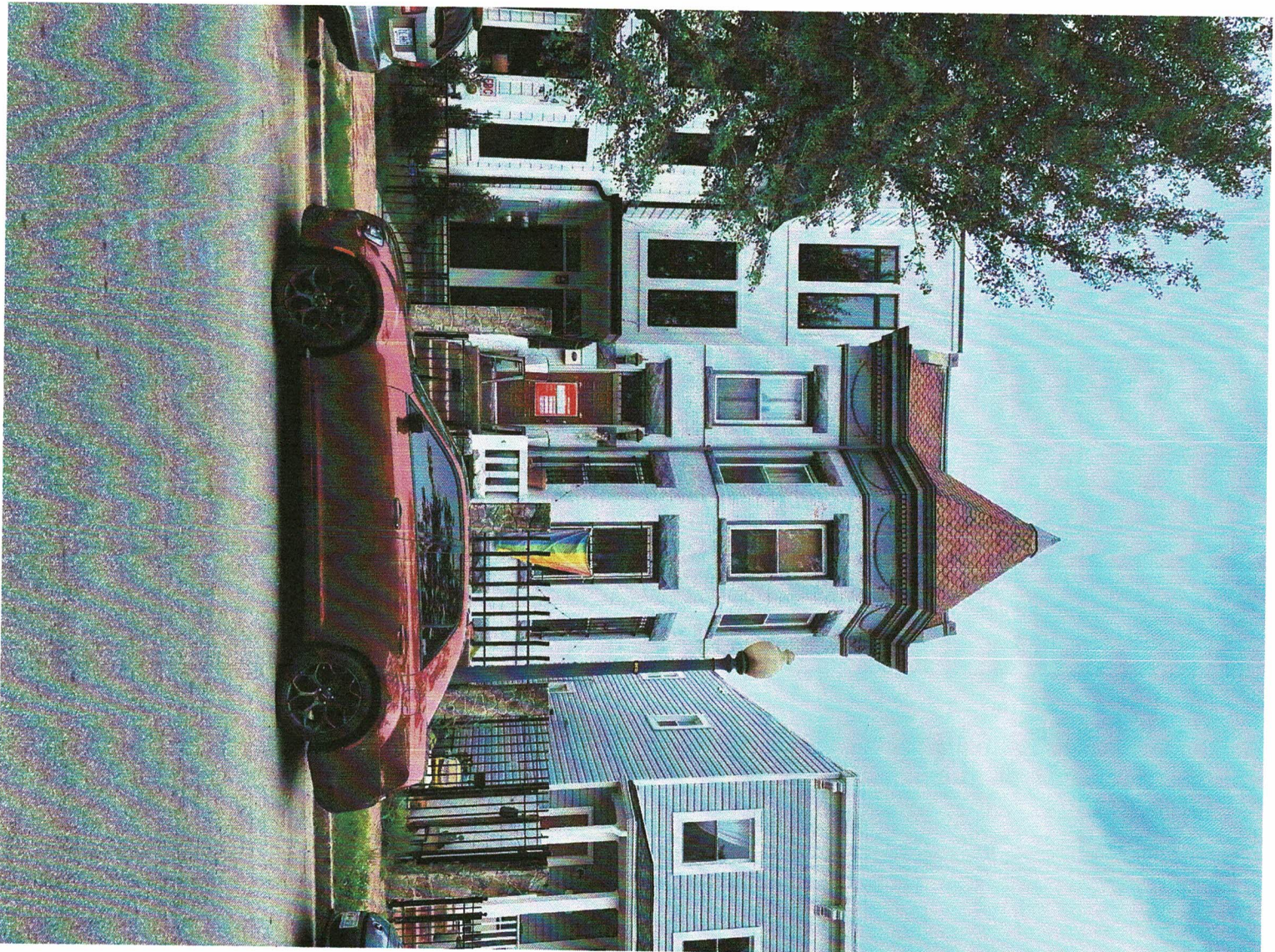
1 - street front on Morton St NW

Affidavit of Posting Picture Case No. 20778 739 Morton St NW